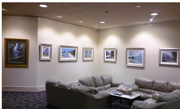
The Artists Corner @ Club Marconi