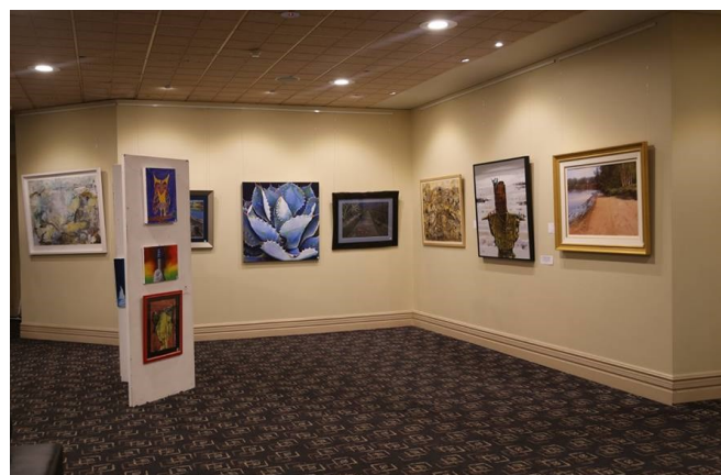
Artists Corner during the 2015 FAP