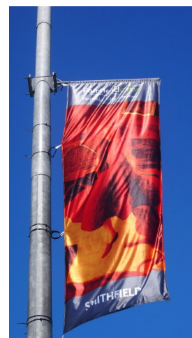
Two of Lorraine’s banners on display at Smithfield