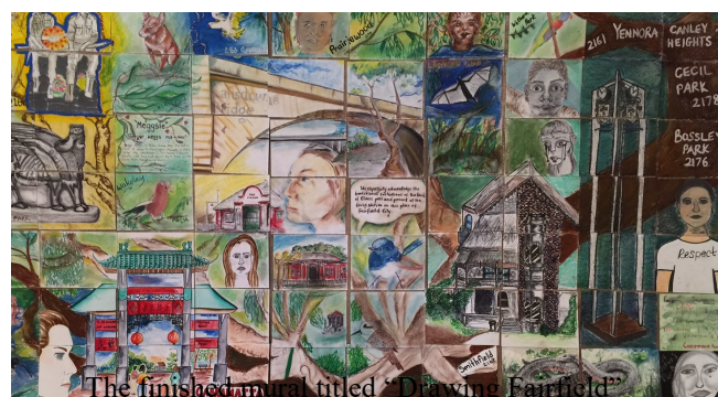
The finished mural titled “Drawing Fairfield”

'Drawing Fairfield' was a unique two day drawing and painting workshop with Lorraine Maggs at the Fairfield City Museum & Gallery. It was held on two consecutive Saturdays 16 & 23 January, 10.30am - 3.30pm in order to create a group mural. The idea was to make a composition from 60 small A5 size boards and to attach them to a hessian backing with velcros. The mural was displayed in the Stein Gallery as part of The Revisiting Exhibition: Lorraine Maggs. The thirteen participants created their own representation of Fairfield's landmarks from supplied photographs, drew their own self portrait with the aid of a mirror, and placed text listing suburbs, postcodes etc. A great piece of community art organized by one of our leading local artists.