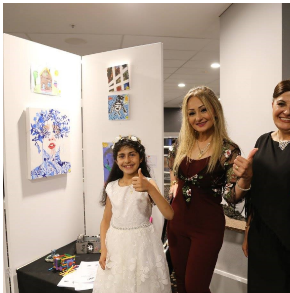
One of the happy Youth Awards recipients

"An eclectic mix of drawings, paintings, and mixed media works reflecting all stages of children's art; the pre-symbolic, symbolic and realist. There is a wonderful vocabulary of forms and various themes emerging from these creative minds!"