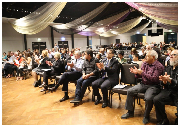
Opening night in the Auditorium, Club Marconi