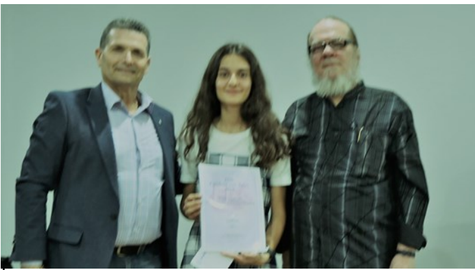
One of the happy Youth Awards recipients