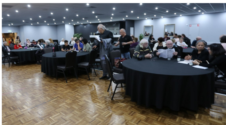
Opening night in the Elettra Room, Club Marconi