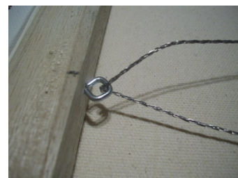
Eye hook with