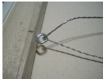
Eye hook with wire or cord.